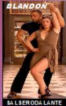
SA L SERODA LANTE